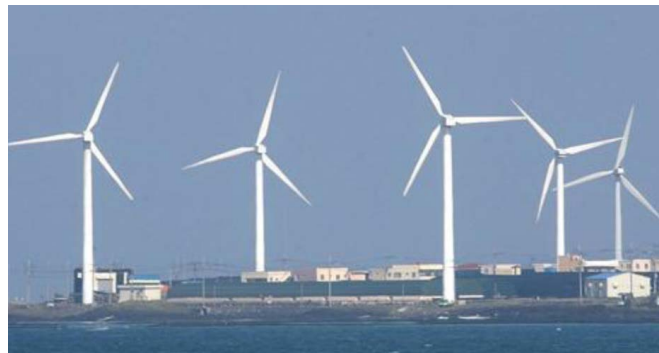
Jeju Global Research Center, Korea Institute of Energy Research

Tel: +82 51 510 2463, Fax: +82 51 518 8442